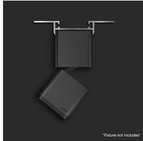
*Fixture not included